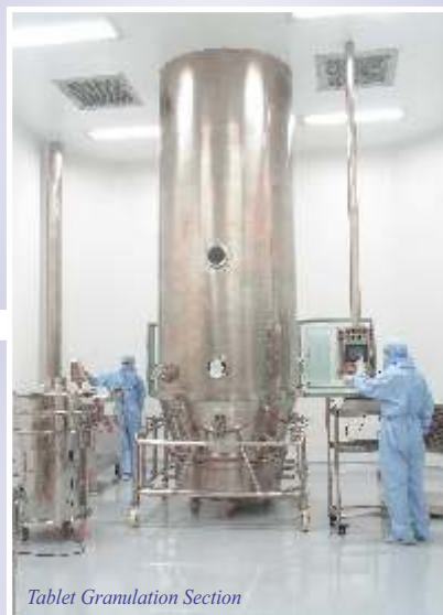
Tablet Granulation Section